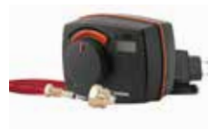
CRS131/CRS135 230 VAC

Thanks to the special interface between the controller series CRS100 and the ESBE series VRG, VRH and VRB, the unit as a whole has a unique stability and precision when regulating.