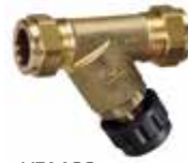
VFA100 Compression fitting

ESBE filling valves for the filling of heating system and other closed fluid systems.