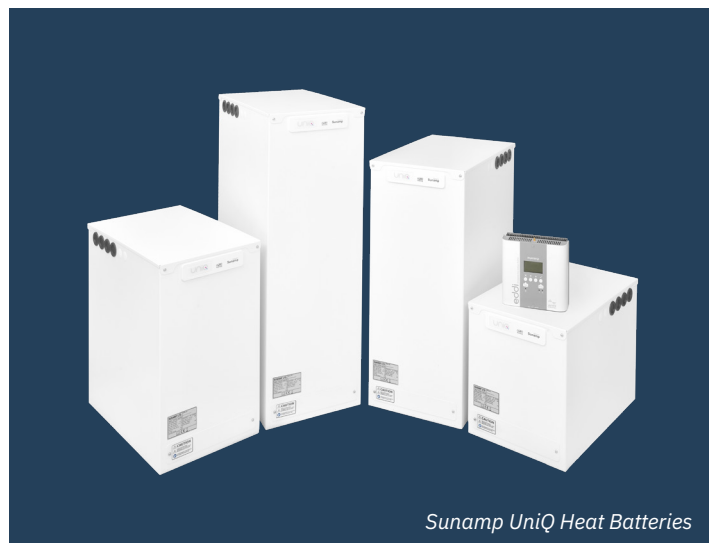
Sunamp UniQ Heat Batteries

Call us on 01489 779068 or email projects@esscogroup.co.uk for a quotation or to find out how we can add value to your next project.