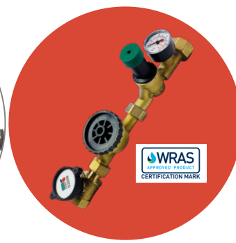
Water Meter Assemblies