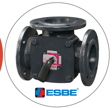
HVAC Valves and Actuators from ESBE