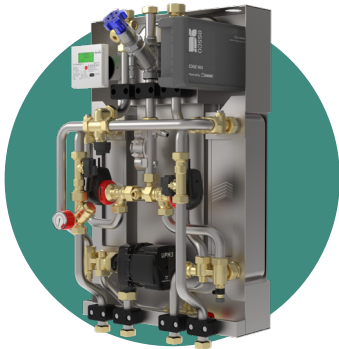
BESA Tested EDGE Heat Interface Units