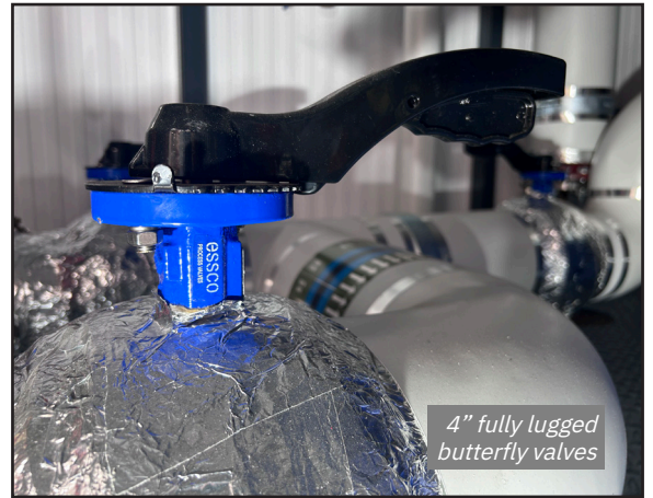
4" fully lugged butterfly valves