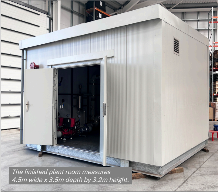
The finished plant room measures 4.5m wide x 3.5m depth by 3.2m height.